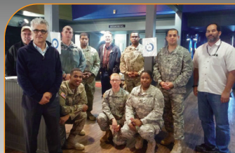
Members of Chapter 147 Ft. Bragg, NC

There are 115 local SBE chapters in the U.S., Eastern Europe and Hong Kong where you can connect with fellow technical professionals. Regular chapter meetings and special events offer you a chance to expand your technical knowledge through industry presentations, tours and sharing of practical tips and solutions with your peers. Local chapters are also a place where colleagues may become lifelong friends.