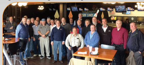
Members of Chapter 45 Charlotte, NC, gather for a holiday lunch.

Locate your nearest SBE chapter at the SBE website at sbe.org/find-a-chapter . Chapters are organized alphabetically by state and include the chapter name and number, its regular meeting time, chapter website address and chapter chair contact information.