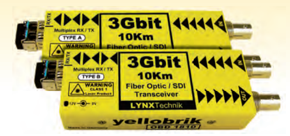
10km SDI/Fiber Bidirectional Transceiver (send and receive over single fiber connection)