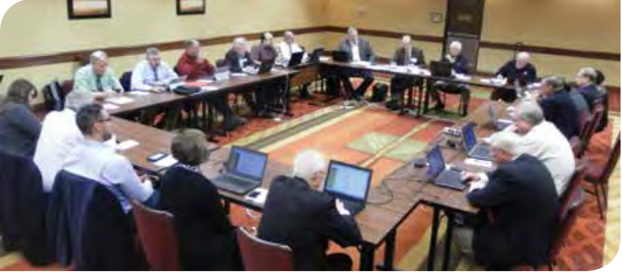
The SBE Board of Directors meeting in Denver at the SBE National Meeting.

that. For annual member dues plus an additional cost that is less than the member price of two SBE webinars, opting for SBE MemberPlus will allow members to access the ENTIRE catalogue of SBE webinars, plus any new webinars produced during the membership year. Dues for those choosing the SBE MemberPlus option will be $175. Members who would rather pay the traditional annual dues,