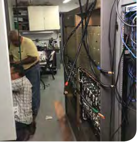
Contractors from Broadcast Site Management installing electrical wiring for the new Nautel GV40. Nautel factory personnel worked to provide a new transmitter within two weeks of the Harvey flood damage.

When hurricane Harvey came roaring into Texas, Houston broadcasters were about as prepared as they could be. Back up sites. Generators. Preparedness plans. And while hurricanes usually come with intense rains, most residents of the upper Texas coast weren't prepared for the heaviest rains in history.