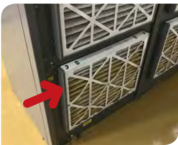
High-water mark on the filters and mud-slicked floor at KSBJ transmitter site.

Houston TV broadcasters didn't escape the flooding. Aside from the usual transmitter site access issues encountered following the flooding, the local CBS affiliate, KHOU-TV, had its entire studio facility wiped out from high water. As the lower level of the facility began to flood, operations moved to the second floor. However, it wasn't long before the electrical system at the facility failed; and the station was dark for the entire broadcast day. At last report, the local PBS affiliate, KUHT-TV, was providing a temporary news set and workrooms for the local news crews.