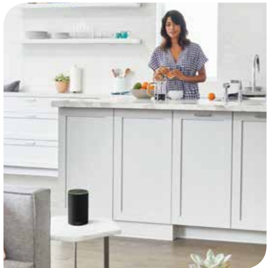
A growing percentage of radio listening is via a smart speaker.