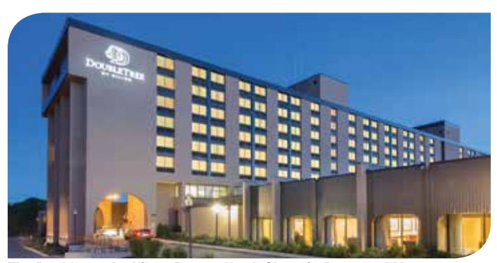
The Doubletree by Hilton Boston North Shore in Danvers, MA

but free to SBE members if they register in advance. Tickets for the SBE National Awards Reception and Dinner ($16) are available through the SBE website, www.sbe.org and by telephone, Monday - Friday from 8:30 a.m. to 4:30 p.m. ET at 317-846-9000. There is no registration or fee to attend the Annual Membership Meeting.